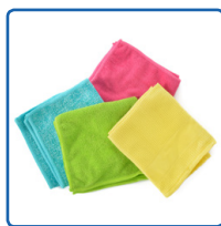
Bag of Rags