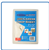
Monarch Canvas Drop Sheet with Plastic Backing