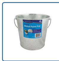
Monarch Metal Paint Pot 4L