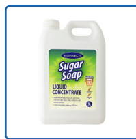
Monarch Sugar Soap Liquid Concentrate 3L