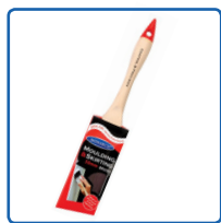
Monarch D & F Brush Moulding & Skirting 38mm or 50mm