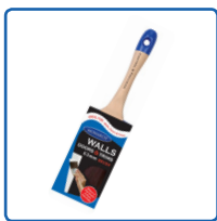
Monarch D & F Brush Walls, Doors & Trims 38mm or 50mm