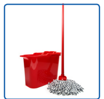
Mop / Bucket