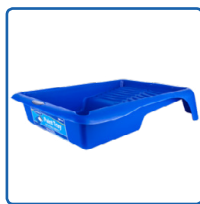
Monarch 180mm Paint Tray