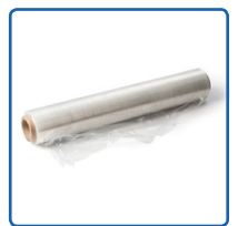
Cling Wrap / Aluminium Foil