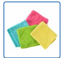
Bag of Rags