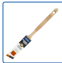
Monarch 25mm Razorback Nytec Angled Sash Cutter