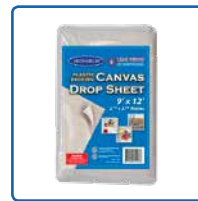
Monarch Heavy Duty Canvas Drop Sheet 8oz