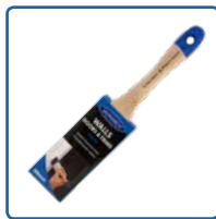
Monarch 50mm Walls, Doors & Trims Brush