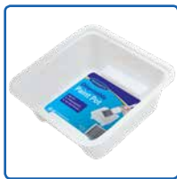
Monarch Disposable Paint Pot